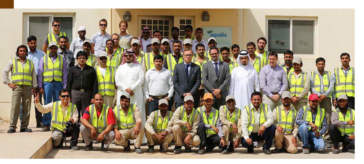
FCC Aqualia's team in Riyadh.

FCC Aqualia, FCC Group's company specialising in end-to-end water management has been operating in Saudi Arabia for the past three years.