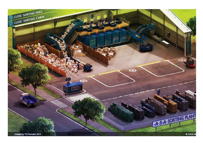
Watch the animation

.A.S.A. presents a new animation, which joins the family of 3 already existing ones: