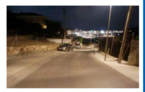
c/Pirineus - AFTER