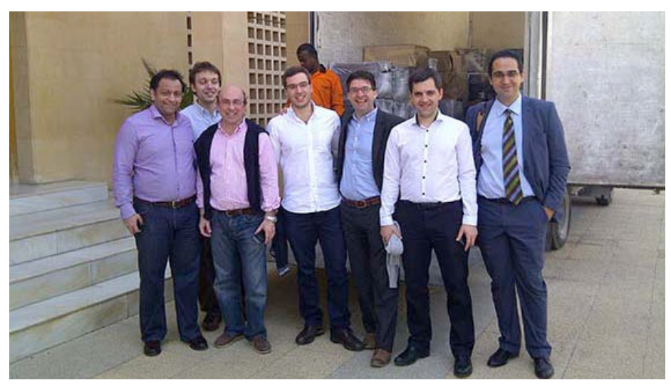
FCC Construction's team in Riyadh.

Work is currently underway to optimise the 6,700 kilometre network that supplies drinking water to more than 3,000 people. The company is also involved in the GIS modelling of the entire network and is performing a study on the operations and optimisation of household water meters. Also in the Middle East, a few months lter FCC Aqualia was awarded a contract for the operations and maintenance of the sewers and sewage treatment system in the emirate of Abu Dhabi.