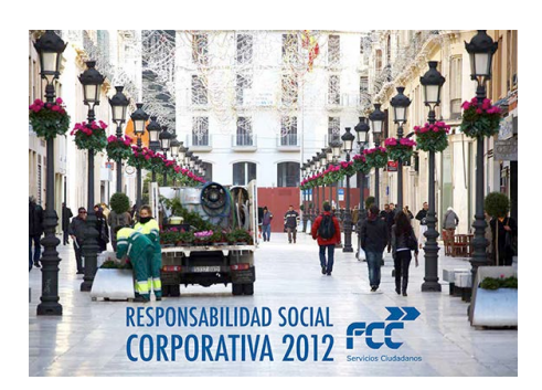
See the 2012 Corporate Social Responsibility Report: PDF

The FCC Board of Directors approved the Company's corporate social responsibility report corresponding to the previous year. This is the eighth CSR Report published by the Group and the seventh one verified by an independent third party, achieving, thanks to the scope of its content, the A+ rating of the Global Reporting Initiative.