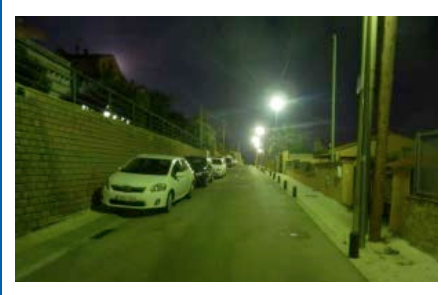
c/Pirineus - BEFORE

After this necessary preliminary phase for carrying out the work and thanks to the collaboration of the City Council and its extensive work the execution of the project was completed within the foreseen term.